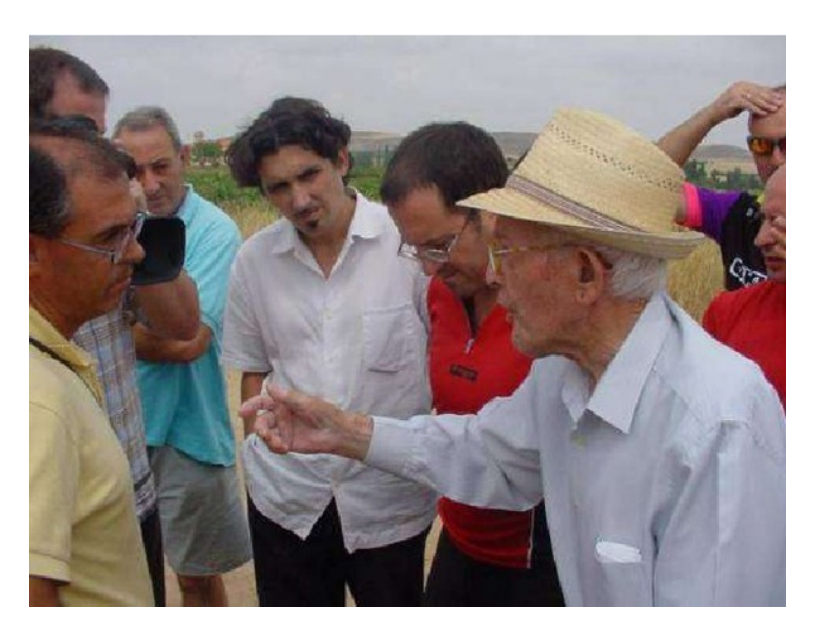
Photo 13: A direct witness speaks out for the younger generations in Olmedillo de Roa, Burgos (2003). [30]

In order to establish an ad hoc video-based methodology for testimony taking in and around mass graves we need to begin by asking ourselves what our final goals are (this question is not always raised by oral history practitioners). In our case these were: 1. to Contribute to gathering of facts concerning the circumstances of the killings and their aftermath, as well as the physical features of those killed, so as to cross-reference them with data gathered by archaeologists and forensics and contribute to possible identifications. Interviews are the appropriate context for collecting family pictures, letters and objects; 2. gather material for academic analysis regarding social memory in comparative perspective; 3. contribute with the material collected to a future audiovisual archive of testimonies of those "defeated" in the Civil War, who were largely silenced for decades. [31]