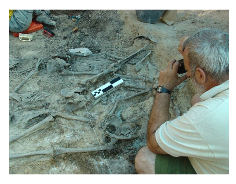
Photo 5: Archaeologist taking photographs of the exhumed remains in Villamayor (Burgos, 2004) [15]

3. Archaeologists and Forensic Anthropologists: Visualizing and Deciphering the Past