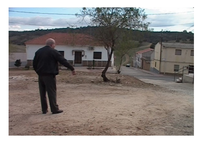
Photo 12: A relative identifies the location of a grave containing seven peasants shot by Franco's troops in 1941 in Fontanosas (Ciudad Real, 2005). [28]

While the sites of these walking interviews are usually Nazi concentration camps, which were, to some extent, already institutionalized sites of memory (NORA, 1989), the exhumations are places of a different nature. As we have seen in the previous section these locations become memory sites while the process of exhumation takes place, and sometimes after it. In this respect, the approach is thus similar to that taken by Claude LANZMANN in his acclaimed documentary project Shoah which combines still and walking interviews, and where the camera serves as a catalytic tool to encourage the interviewee's expression on the spot (FELMAN, 2000). Mass graves are usually located in rural areas, in a roadside, or the outskirts of a village. Firstly, a survivor or a witness will locate the grave. As in Shoah , which begins with the survivor Simon Srebnik returning to his native Poland and identifying the location of the mass killings in the midst of placid prairies and forests, someone will stand in front of our camera and say "this is the place." The camera's images, together with the witness' words, somehow "undress the landscape" (TORNER, 2002, p.34).