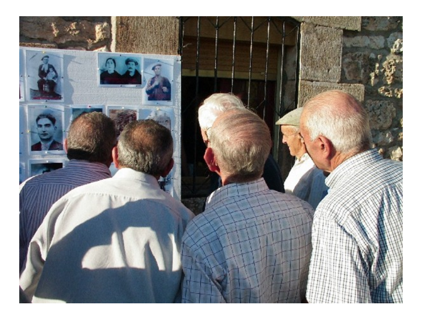
Photo 4: Villamayor neighbors confronting pictures of the exhumed "disappeared" in an exhibition panel outside the village's Civil Center during the "corpse devolution" public act (2006) [12]

As regard to the third type of visualization of disappearance, namely videotestimonies, the mission attributed to them, as Annette WIEVIORKA (1994) has emphasized, "is no longer to bear witness to inadequately known events, but rather to keep them before our eyes." In other words, what is valued here, again, lies beyond the explicit content of the testimony. It is the actual act of bearing witness to the traumatic events. The term "moral witness" (MARGALIT, 2002), as opposed to the judiciary—or epistemological—witness is quite meaningful in these contexts. Video-testimony in particular, of survivors or witnesses, serves this purpose with extraordinary force. In the mass grave exhumation projects, recording video-testimony is almost as important as the exhumation. As the corpses are made visible, the disappeared recover their identity through the spoken words and bodily expression of those who remember them. The videotestimony archive of "memory donors" is not only a source of information, though we certainly encounter insufficiently known events on occasion, or at least events which were never spoken about publicly or for historical record. However, the different video-testimony untertakings and their digital collections are restitution projects and moral containers, symbols of past tragedy and present homage. In short, we might say, paraphrasing FOUCAULT (1969/2002) that the document becomes the monument. [13]