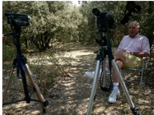
Photo 14: A space prepared for videotestimony taking close to the mass grave in close to the mass grave in Villamayor Uclés