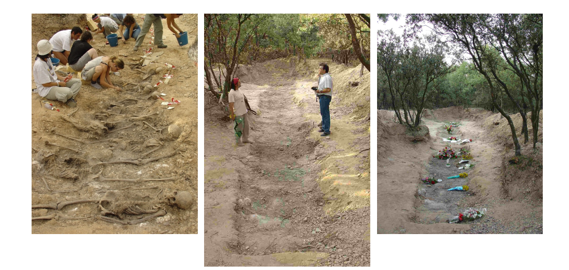
Photo 1, Photo 2, Photo 3: Sequence of pictures of the exhumation at Villamayor, Burgos, on July of 2004. First, skeletons of fusilados as they are being dug up by forensics and archaeologists. Second, a member of the archaeological team speaks to a member of the local association across the emptied mass grave. Third, the same grave covered with flower bouquets after a commemorative ceremony. [9]

If we examine the forms which memory of genocide and of other modes of extreme violence have taken over the last few decades we find three main ways of recording and displaying a certain form of disappearance: (1) pictures of the open grave with its skeletons or loose bones, (2) the desaparecidos ' (missing victims) portraits, and (3) video-testimony of the witness or survivor. All three are nowadays conventional modes of visualizing traumatic memory. In today's memorial media culture (HUYSSEN, 1993), their iconic power as memory prompts cannot be sufficiently stressed. [10]